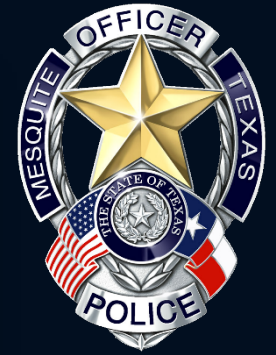
MPD Police Academy BPOC #4 Graduates April 1, 2016