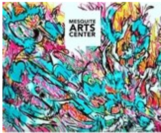
LANNY QUARLES COLLAGE | INK SERIES MAIN GALLERY | JAN 9 - MAR 27

In the latest Road Warrior video, the Public Works Department updates us on new road constructions in the Town East Estates and Quail Hollow Drive areas. And other ongoing road work in the Peach Tree and South Parkway areas. Watch here.