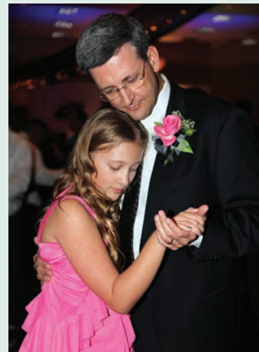
The Daddy-Daughter Dance is set for February 7.

Please note that adults accompanying multiple children cannot reuse their ticket from Session 1 for Session 2, and tickets purchased at the door will be $20.