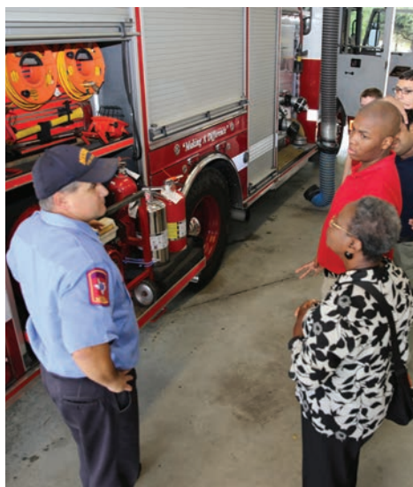
In October, as part of Fire Safety Month, the Mesquite Fire Department hosted various fire station tours and presented fire safety tips at many community events.