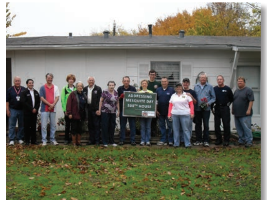
City staff and community volunteers completed the 500th project through the Addressing Mesquite Day program.

In 2011, The International City/County Management Association presented Mesquite the Community Partnership Excellence Award for demonstrating innovation, excellence and success to improve the quality of life for residents.