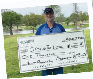
Spread The Love

Spread the Love: On April 2, in honor of National Peanut Butter and Jelly Day, the Mesquite AMBUCS club made a $1,000 donation to the annual Spread the Love food drive that supports Mesquite Social Services and Sharing Life Community Outreach.