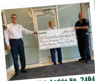
Mesquite Elk's Lodge No. 2404 and Elk's Ladies Auxiliary

Governor's Community Achievement Awards: Keep Texas Beautiful awarded Mesquite 2nd place in the Governor's Community Achievement Award for its efforts to keep the community attractive and environmentally conscious.