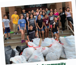
Governor's Community Achievement Awards

Spread the Love: On April 2, in honor of National Peanut Butter and Jelly Day, the Mesquite AMBUCS club made a $1,000 donation to the annual Spread the Love food drive that supports Mesquite Social Services and Sharing Life Community Outreach.