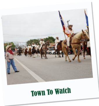
Town To Watch

Town to Watch: Mesquite was named a “Town to Watch”, thanks to its deep western roots, in True West Magazine’s February – March 2020 Issue