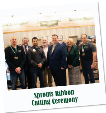
Sprouts Ribbon Cutting Ceremony

Silver Fleet Award: The City of Mesquite’s Equipment Services Division of the Public Works Department was recognized as a 2019 Silver Fleet Award Winner. The annual honor, awarded by the Dallas - Fort Worth Clean Cities Coalition (DFWCC), recognizes fleets for their commitment to a cleaner environment