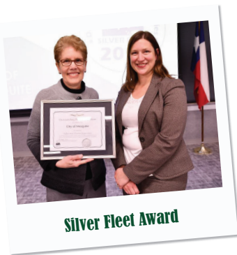
Silver Fleet Award

Town to Watch: Mesquite was named a “Town to Watch”, thanks to its deep western roots, in True West Magazine’s February – March 2020 Issue