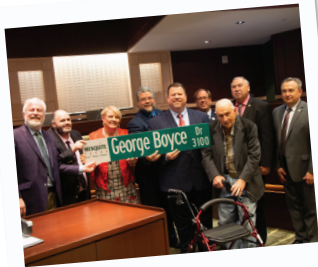
George Boyce Drive

On Feb. 1, the Mesquite Police Department led the charge and helped raise more than $22,000 for Special Olympics Texas at the annual Polar Plunge.