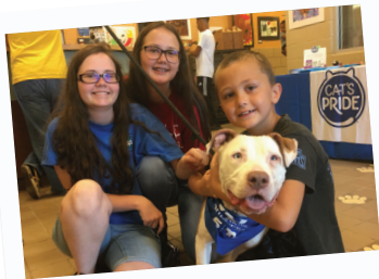
Mesquite Animal Shelter (MAS)

On Aug. 17, the Mesquite Animal Shelter (MAS) hosted the 2019 Clear the Shelter event and 89 animals were adopted by new families. The annual event waives all adoption fees for one day. MAS also recently celebrated 24 consecutive months of a more than 90 percent save rate for all its animals.