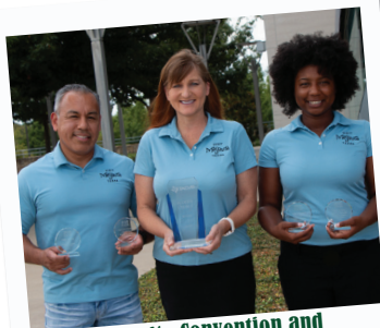
Mesquite Convention and Visitors Bureau (CVB)

On Aug. 17, the Mesquite Animal Shelter (MAS) hosted the 2019 Clear the Shelter event and 89 animals were adopted by new families. The annual event waives all adoption fees for one day. MAS also recently celebrated 24 consecutive months of a more than 90 percent save rate for all its animals.