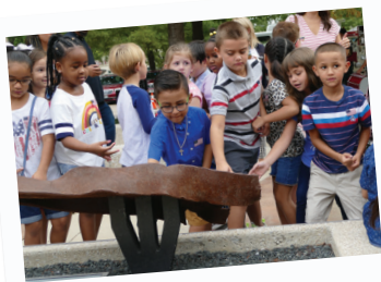
Freedom Park Remembrance

The Mesquite Convention and Visitors Bureau (CVB) received five awards at the recent Texas Association of Convention and Visitors Bureau's Annual Conference for excellence in destination marketing. The awards included the People's Choice Awards for its budget size in the categories of Advertising, Website, Mobile Site and Video.