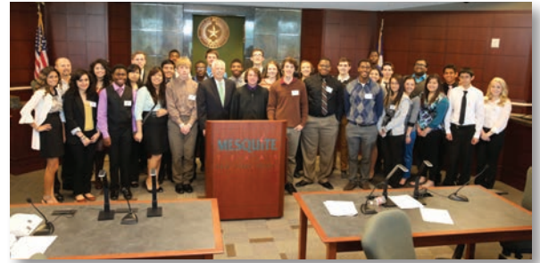
In April, the City of Mesquite welcomed student leaders from the five local high schools to City Hall for Student Government Day which featured tours and special activities.