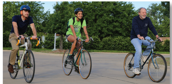
The Community Development Department promoted the May 16 Bike to Work event with special activities.

Mesquite Firefighters were out in the community during May seeking donations for their annual fundraising efforts for the Muscular Dystrophy Association.