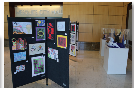
Mesquite City Hall recently hosted various works of art and sculptures from Mesquite Independent School District students.