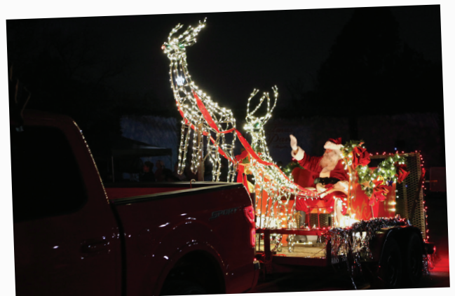
On December 2 and 3, the "Here Comes Christmas Parade" ended each day's festivities at this year's Christmas in the Park celebration at Westlake Park.