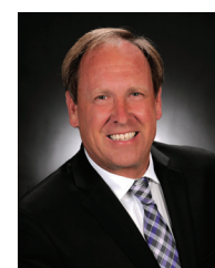
Tandy Boroughs Councilmember Place 6