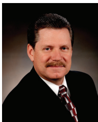
Stan Pickett Mayor

There are other ways the public can stay informed on City Council actions. Regular meetings are held on the first and third Mondays of each month at 7 p.m. in the Council Chambers at City Hall, 757 N. Galloway Avenue. Meeting agendas and minutes are available online at www.cityofmesquite.com/CouncilAgenda . In addition, City Council meetings can be watched live online as well as on-demand episodes of past meetings at www.cityofmesquite.com/WatchCouncilMeetings . Mesquite news and updates are also available in the weekly e-publication The Council Connection posted online at www.cityofmesquite.com/CouncilConnection .