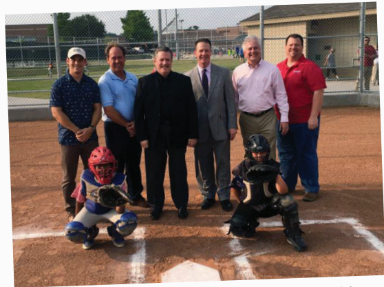
On May 18, a public re-dedication was held for Vanston Park after extensive renovations and improvements were completed. The celebration included free hot dogs, snow cones, popcorn and more.