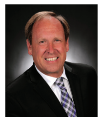
Tandy Boroughs Councilmember Place 6