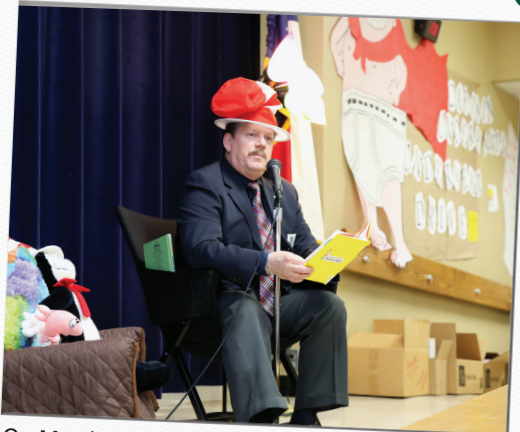
On March 2, the Mesquite Police Department, the Mesquite Fire Department and Mayor Stan Pickett participated in the "National Read Across America" activities at Cannaday Elementary School.