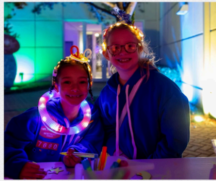
WINTER GLOW FEST