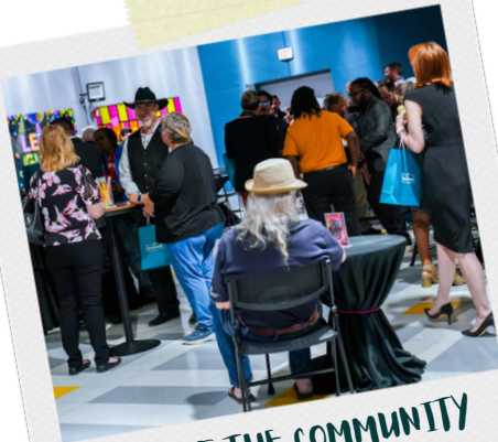
STATE OF THE COMMUNITY