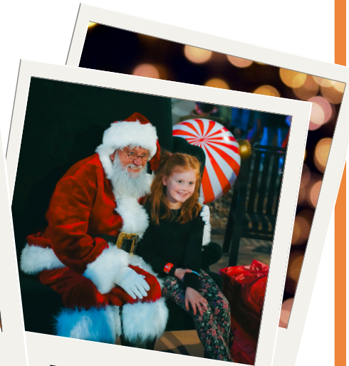
Photos with Santa Claus