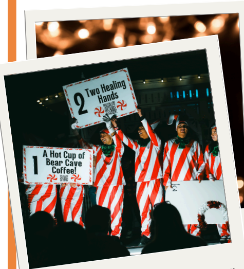
"12 Days of Downtown Mesquite"

It was a hometown holiday to remember in Mesquite! Residents and visitors enjoyed a variety of festive gatherings as part of 2024 Real. Texas. Holidays., starting with Christmas on the Square on Dec. 3.