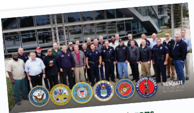
City Employee Veterans

Just For Kids: Peeler and Rose, an interactive marionette show Jan. 19, from 10 - 11 a.m., in the Black Box Theatre. This event is free.