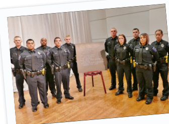
Graduates of BPOC 9

Just For Kids: Canvas Creations , from 10 – 11:30 a.m., on December 1. Kids of all ages will receive a painting tutorial and take home their new masterpieces. This event is free.