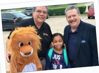
Walk To School Day