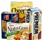
Chipboard (such as cereal and cracker boxes)