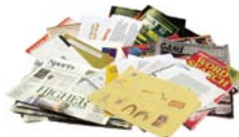
Newspaper, Magazines, Junk Mail, Phonebooks