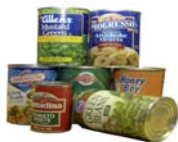
Steel and Tin Cans (Rinse, leave labels)