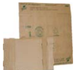
Cardboard (Flatten and place in or under bin)