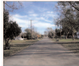
The current condition of the residential core in the Truman Heights Neighborhood District.