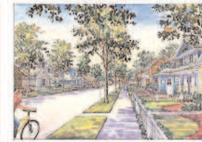
The streetscape improvements, exterior home improvements and all housing developments within the residential core of the Truman Heights Neighborhood District. Improvements and all housing developments are illustrated according to the standards created in the Truman Heights Revitalization Code.