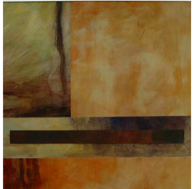
Windows by Cecilia Thurman

I use landscape primarily because the energy, shapes, and colors found in nature best allow me to describe my thoughts and to explore the essence of line, shape, and texture inherent in the subject — Cecilia Thurman