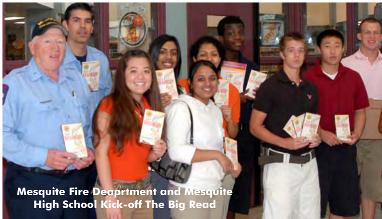
Mesquite Fire Department and Mesquite High School Kick-off The Big Read

Mayor Monaco will proclaim the month of October as The Big Read in Mesquite. State Senator Bob Deuell and Congressman Jeb Hensarling will attend the October 6 City Council meeting to make comments about the National Endowment for the Arts project and recognize The Big Read partners.