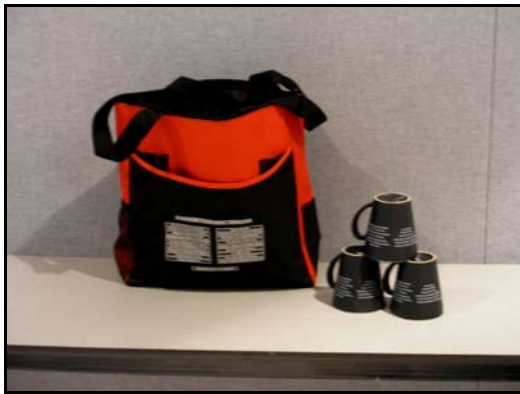
Mesquite Arts Center – TOTE Bags & MUGS

For information please call 972-216-6444