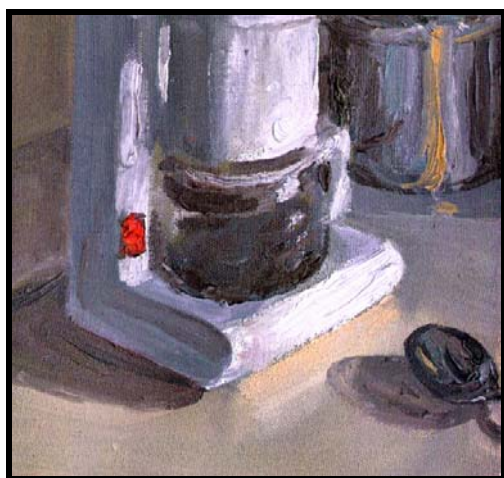
Exhibit June 2nd through 30th

“This is my experience with light and space, with shape and color, with moment and time. This is the bright morning and the soft afternoon. This is the thickness of night. This is the space between paint and brush, oil and wood, window and wall. This is what I see. Everyday. This is the brief moment. This is a shadow in the doorway. This is a stripe of light. This is the mundane. This is a dirty dish and a lone shoe. This is the temporal. This is what I see. Everyday. This is my experience.”