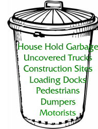
7 sources of litter

Trash Bash: As part of the annual Don't Mess with Texas Trash off, community groups, local businesses, MISD, City of Mesquite and individuals work together at the bi-annual Trash Bash event to focus on the key areas of the city for litter removal.