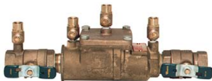
Double Check Assembly

The Public Works Backflow Inspector will conduct a survey of your business to determine the need for the installation of Backflow Prevention Assemblies to protect the public water supply.